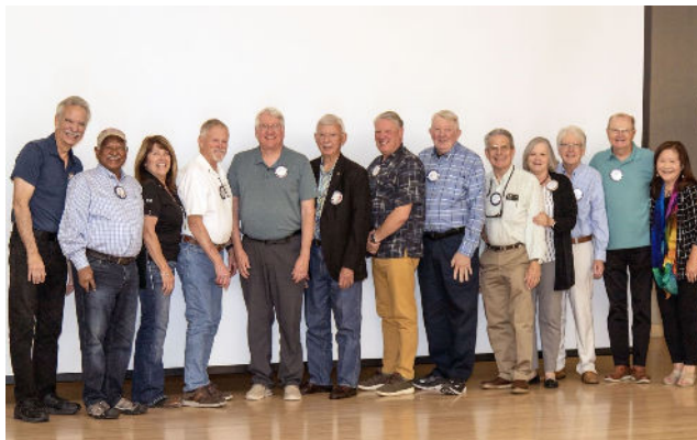
Figure 3: Paul Harris Society Members