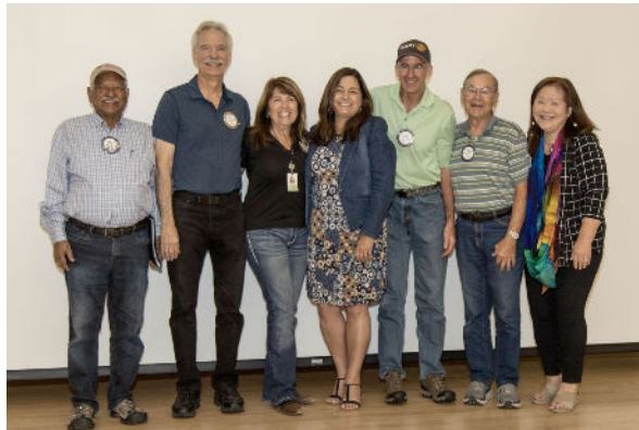
Figure 2: Multiple PHF Recipients