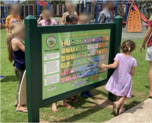
Photo of typical Communications Board in a Children's Park. For communication from or to autistic children or between children who don't speak the same languages, the icons on the board allow a kind of sign-language communication to be performed. At least seven of these Communication Boards will be erected in LARPD parks in conjunction with the LARPD organization and LARPD Foundation.

Keep in mind that all of these grants are paid for through your prior contributions to The Rotary Foundation of Rotary International .