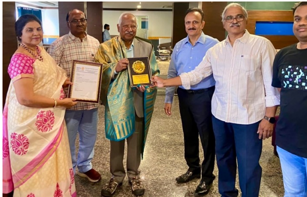
Recognition by Mavericks RC