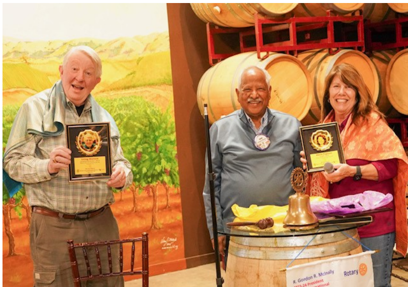
Plaques presented to the President and International Services Chair